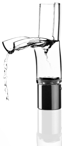
Bend by ECAL/Stanislaw Czarnocki & Katarzyna Kempa

The conical shape above the spout creates a space to stack glasses in a smart way, conveniently providing drinking glasses and keeping the sink space tidy.