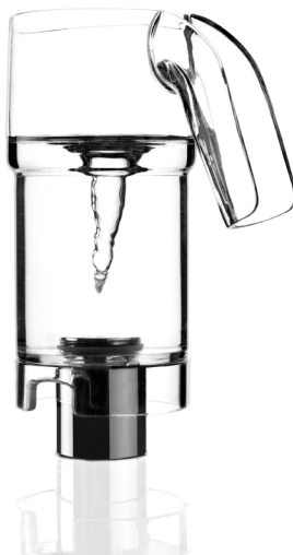
Carafe by ECAL/Léa Pereyre & Claire Pondard

Starting with a standard tube shape and adding a single cut, the spout portion of the faucet is bent away from the main body of the faucet. This elegant solution speaks towards simplicity in production methods.